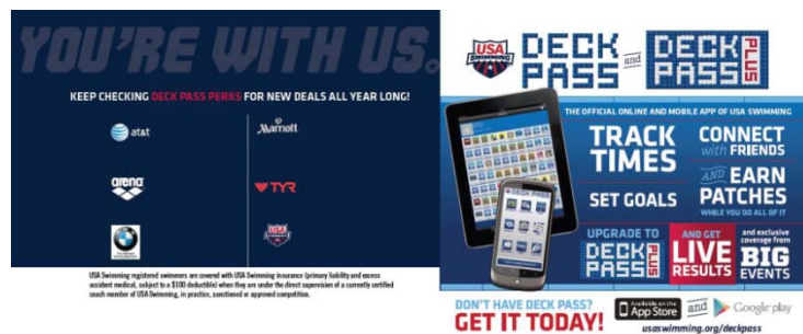
Back of card